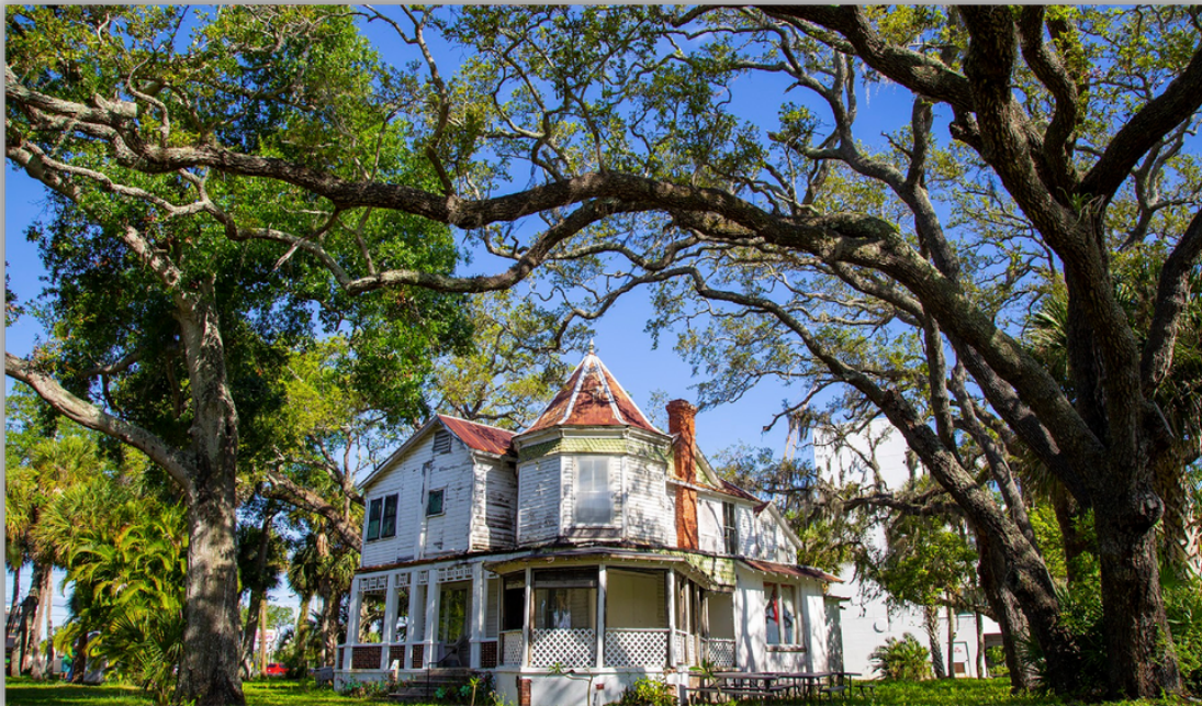
Green Gables, Brevard County, a Special Category Grants project funded in FY2023.