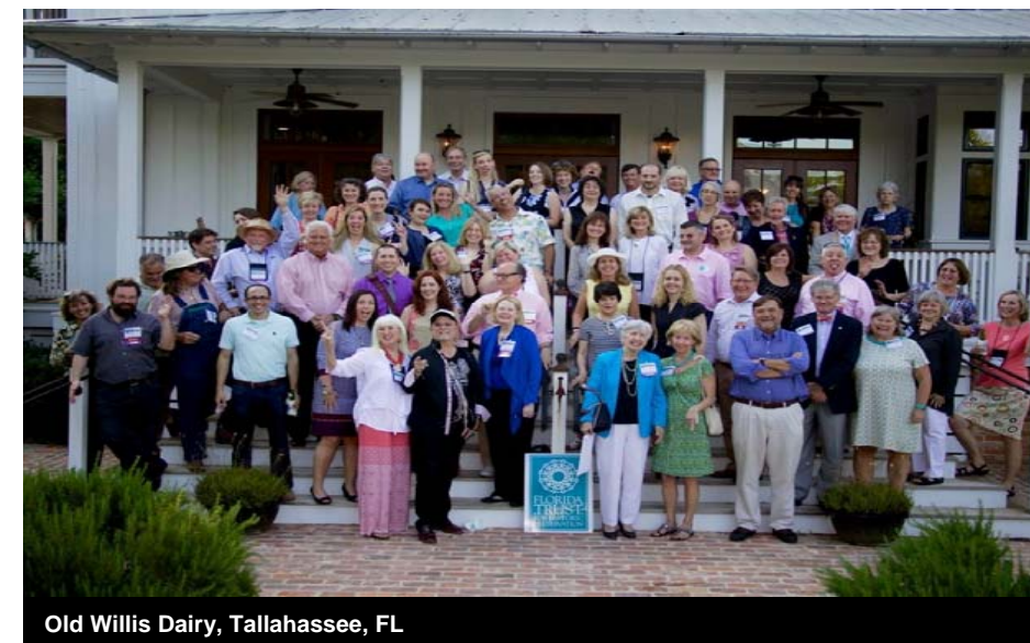
Old Willis Dairy, Tallahassee, FL

On behalf of the Florida Trust for Historic Preservation, I want to take the opportunity to say how excited we are to have the City of St. Petersburg hosting our Annual Conference. The spirit of our great city, which we all know and appreciate, will be truly embraced by the attendees of the conference in May 2017. The Florida Trust, its Board of Trustees and our local conference committee cannot express enough gratitude for your collaboration with us in making our 2017 Conference a huge success. Without special contributors like you, this event would not be possible. We look forward to a highly engaging conference well attended by our supporters of historic preservation from throughout this great State of Florida. Thank you so much for your participation!